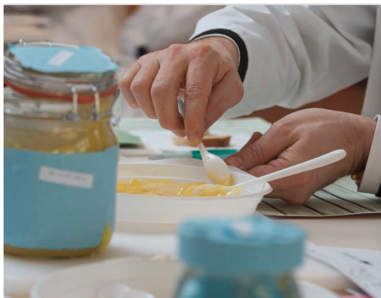
At the International DLG Quality Tests, experts assess the quality of honey in extensive sensory tests.

For example sweet chestnut honey is particularly pollen-rich, while robinia honey or alpine rose honeys are considered to be low in pollen. Variety determinations are therefore carried out through a combination of pollen analyses, chemical parameters and sensory analyses.